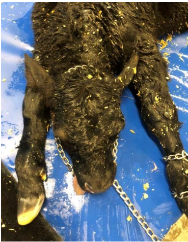
Figure 2: Chain placement around head and into mouth. Also referred to as a head snare or 'war bridle.'