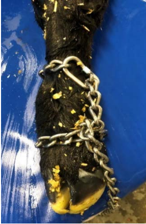
Figure 1: Chain placement above and below the fetlock.