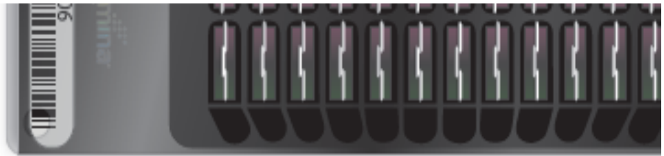
Figure 2. BovineSNP50 from Illumina, Inc. A genotyping chip with 24 wells that each contains DNA probes for 50,000 genotypes.